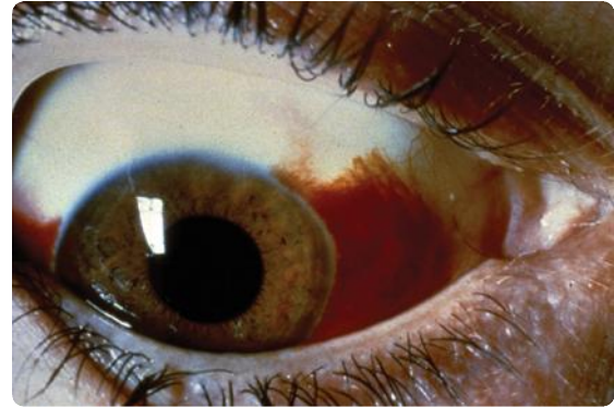
A subconjunctival hemorrhage is when blood appears in the white of the eye from a broken blood vessel.

A hyphema usually happens when an injury causes a tear to the iris or pupil of the eye. Sometimes people mistake a broken blood vessel in the front of the eye for a hyphema. A broken blood vessel in the eye is a common, harmless condition called subconjunctival hemorrhage. A subconjunctival hemorrhage does not hurt. A hyphema, though, is usually painful. A hyphema must be treated properly or it can cause permanent vision problems.